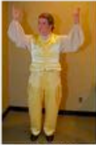
Actor 2 Basic