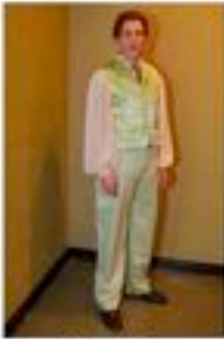
Actor 5 Basic