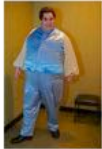
Actor 1 Basic